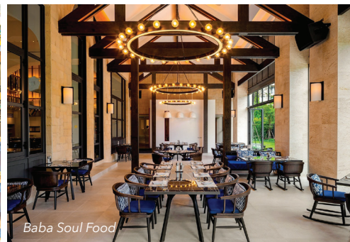
Baba Soul Food