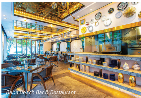
Baba Beach Bar & Restaurant